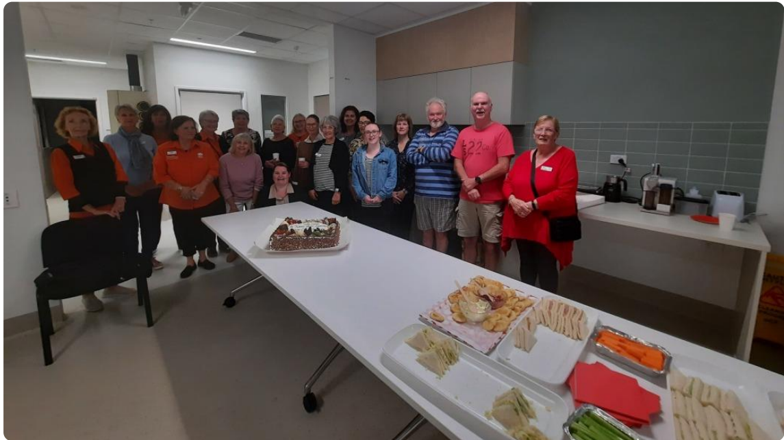
Tweed Valley Hospital volunteers at their afternoon tea.

Tweed Valley Hospital hosted a belated National Volunteers Week afternoon tea on 28 June, taking the opportunity to welcome their volunteers with an official cake cutting.