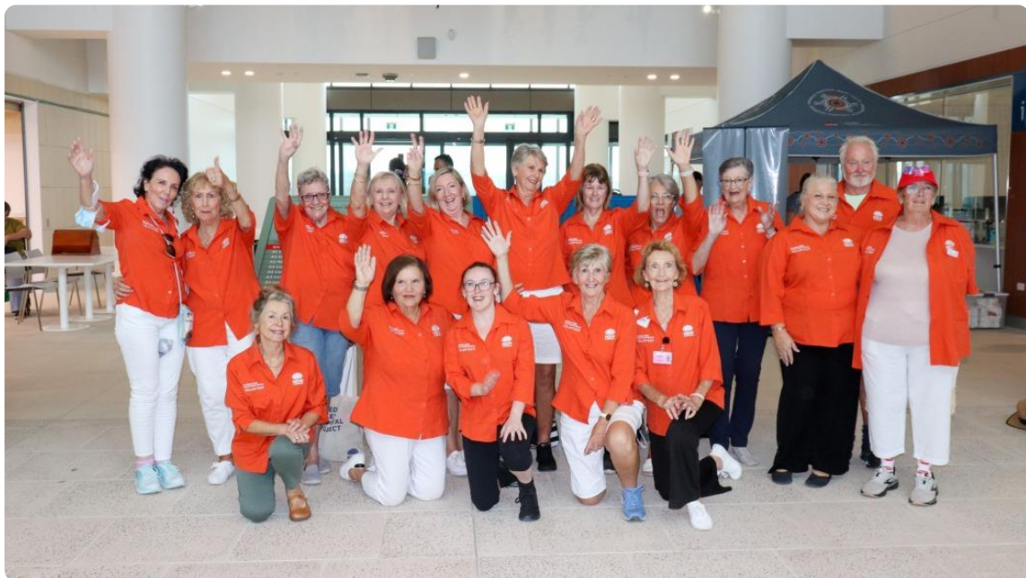
Volunteers at the open day.