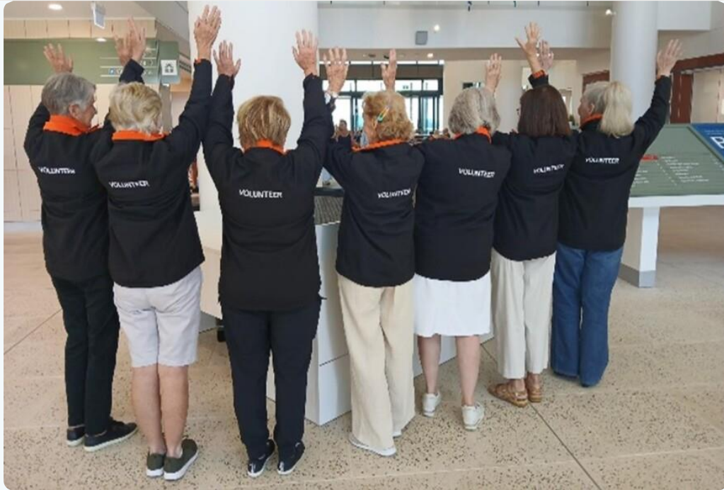
Healthcare Helpers proudly showing off their new winter jackets.